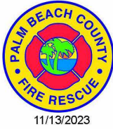
Exhibit F – Fire Rescue Department's Municipal Call Type Report Chart