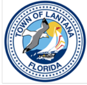
Exhibit D – Budget-In-Brief (September 30, 2023)